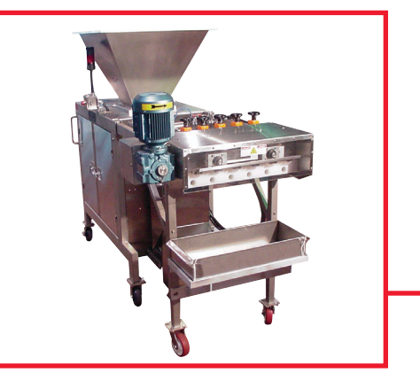
High Speed Bun Divider